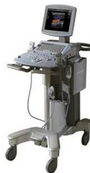
SuperCart Ultrasound System