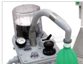
Flexible bag arm

Mindray North America 800 MacArthur Blvd., Mahwah, NJ 07430 Tel: 800.288.2121 Tel: 201.995.8000 Fax: 800.926.4275 www.mindray.com