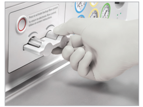
Backup gas (O 2 and Air)