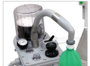
Flexible bag arm