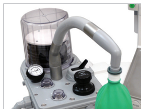
Flexible bag arm

Mindray North America 800 MacArthur Blvd., Mahwah, NJ 07430 Tel: 800.288.2121 Tel: 201.995.8000 Fax: 800.926.4275 www.mindray.com