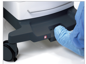
Brake and cable sweeps