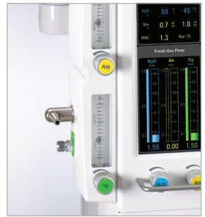
O 2 /Air